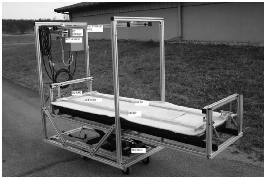
FIG. 2 Cleaning Bed Apparatus

8.3.1 Vacuum new test carpet panels using a rotating agitator-equipped vacuum cleaner to remove any loose materials before soiling and testing.