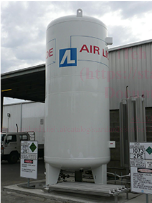
FIG. 2 Cryogenic Oxygen Storage

7.4 Noncryogenic Production —Noncryogenic oxygen production processes include pressure swing adsorption (PSA), vacuum swing adsorption (VSA), and membrane separation. In general, these methods produce oxygen less pure than cryogenically produced oxygen—typically <97 %, with the balance being nitrogen, argon, and carbon dioxide. However, these processes use less power and offer a cost advantage for high-volume users who do not need higher purity.