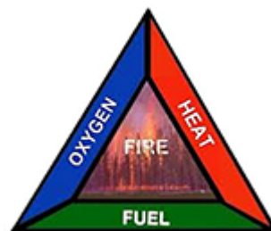
FIG. 3 The Fire Triangle

7.3 Ultrahigh-Purity Oxygen —There are a few markets that require high- and ultrahigh-purity oxygen. High-purity oxygen typically delivers >99.99 % purity, whereas the demands of the semiconductor industry have resulted in the marketing of >99.999 % purity oxygen.