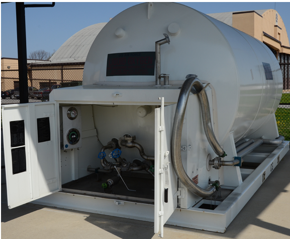
FIG. 1 Skid-Mounted Cryogenic Oxygen Storage