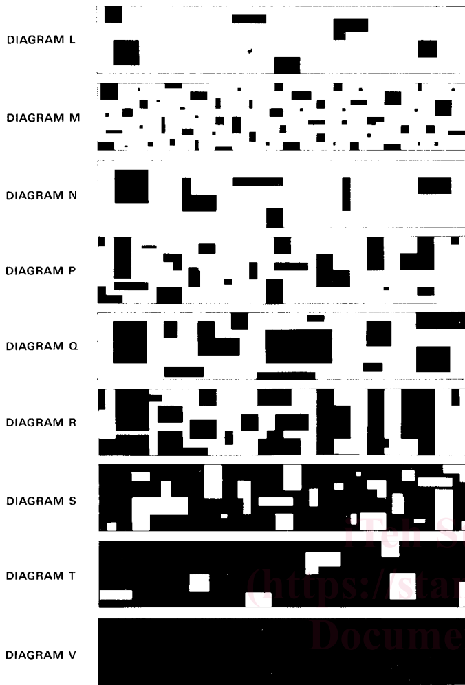
FIG. 3 Extent Within Affected Area Diagrams (L Through V)

or a piece of deck machinery. The purpose of the code is to identify positively the area being inspected so that a history of inspection data can be gathered. For sections of the ship other than decks and deck machinery (that is, underwater hull, boottop, topside, superstructure, tanks, and voids), it is possible to develop a general diagram of the ship section. Divide the ship section into logical inspection areas, and provide inspection area codes for these inspection areas. Decks and deck machinery vary so greatly between ship types that the development of a general diagram with logical inspection areas and inspection area codes is not feasible. It should be the responsibility of the organization that authorizes the inspections to develop the ship diagram, logical inspection areas, and inspection area codes and to make certain that this same coding system is used during all subsequent inspections.