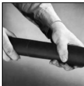
FIG. 2 Apply Adhesive to all Butt Joints Installed/Existing Pipe Work