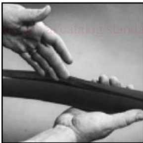
FIG. 3 Apply Unslit Insulation to Straight Pipe

fabricated fitting. Place over bend and press seams firmly together. See Fig. 7. Fabricate 45s in a similar manner.