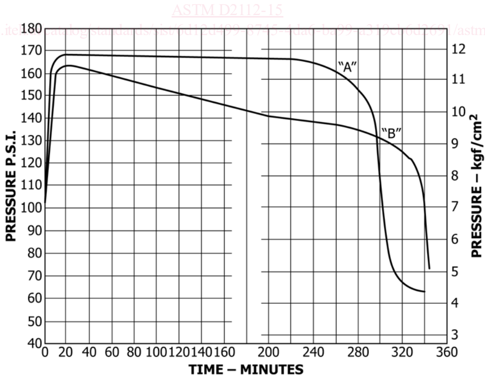
FIG. 3 Pressure Versus Time Plot of Two Rotary Vessel Oxidation Test Runs

9.4 The test is complete after the pressure drops more than 172 kPa (25 psi) below the maximum pressure. The 172-kPa