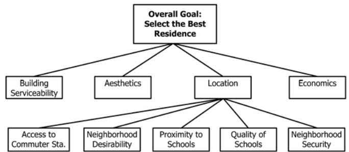
FIG. 4 An Example Hierarchy for the Problem of Selecting a Residence

8.2.2 The real estate salesperson does the AHP analysis a second time once the client has seen the selected houses and has additional information for constructing a more detailed decision matrix. An AHP analysis with a graphical presentation of the score of each house helps satisfy homebuyers that they are selecting the house that is best for them.