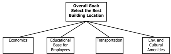
FIG. 7 An Example Hierarchy for the Problem of Selecting a Building Location

be an attractant to the existing headquarters staff whom they hope will stay with the company after the move to the new building. Time is important because the lease on the existing headquarters building is up for renewal in six months.