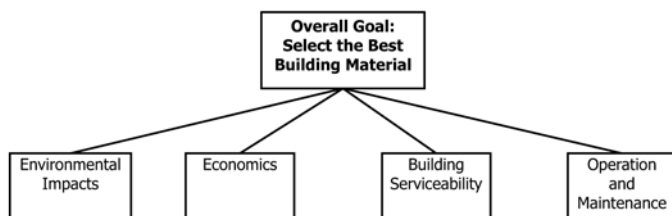
FIG. 6 An Example Hierarchy for the Problem of Selecting a Building Material