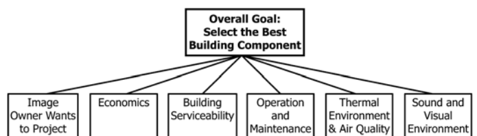
FIG. 5 An Example Hierarchy for the Problem of Selecting a Building Component

8.4 Choosing Among Materials —An architect is working with clients to select materials for a large office building. The clients tell the architect that they want a building made from materials that are friendly to the environment. The clients qualify their specifications, however, to say that they do not want the building’s functions to be compromised by the design or choice of materials. They go on to say that, while they are willing to spend more money on materials to achieve a “green