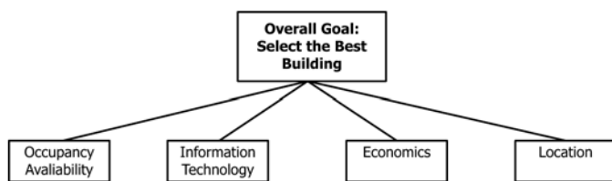
FIG. 1 An Example Hierarchy for the Problem of Selecting a Building

6.4.1 Characterize your MADA problem with a decision matrix similar to Table 1. The decision matrix indicates both the set of alternatives and the set of leaf attributes being considered in a given problem, and it summarizes the “raw” data available to the decision maker at the start of the analysis. A decision matrix has a row corresponding to each alternative being considered and a column corresponding to each leaf attribute being considered. Each element of the matrix contains the available information about that row’s alternative with respect to that column’s attribute. Put quantitative data in the decision matrix if available; use nonquantitative data otherwise.