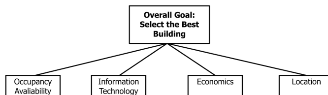
FIG. 1 An Example Hierarchy for the Problem of Selecting a Building

6.4.1 Characterize your MADA problem with a decision matrix similar to Table 1. The decision matrix indicates both the set of alternatives and the set of leaf attributes being considered in a given problem, and it summarizes the “raw” data available to the decision maker at the start of the analysis. A decision matrix has a row corresponding to each alternative being considered and a column corresponding to each leaf attribute being considered. Each element of the matrix contains the available information about that row’s alternative with respect to that column’s attribute. Put quantitative data in the decision matrix if available; use nonquantitative data otherwise.