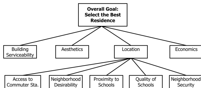
FIG. 4 An Example Hierarchy for the Problem of Selecting a Residence