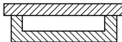
FIG. 2 Flash Mold with Machined Cavity