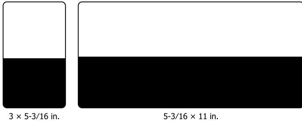
FIG. 2 Examples of Commercially Available Test Panels

3.2.1 T , n —the specified or measured thickness of the test coating on the substrate.