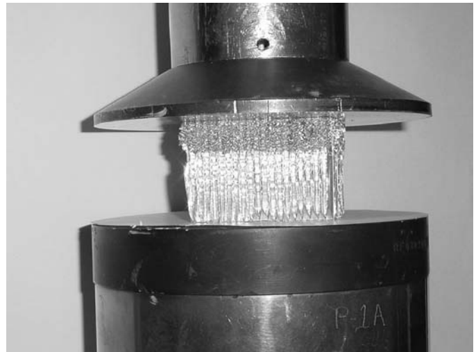
FIG. 2 Close-up of Specimen Between Loading Platens Being Crushed

7.2 Loading Platens —Force shall be introduced into the specimen using fixed flat platens (58 HRC minimum as specified in Test Methods E18). One platen may be of the spherical seat (self-aligning) type, if it is capable of being locked in a fixed position once the platen has contacted and aligned with the specimen. The platens shall be well-aligned (centered with respect to the drive mechanism loading train) and shall not apply eccentric forces. A satisfactory type of apparatus is shown in Figs. 1 and 2. The platen surfaces shall extend beyond the test specimen periphery. If the platens are not sufficiently hardened, or simply to protect the platen surfaces, a hardened plate (with parallel surfaces) can be inserted between each end of the specimen and the corresponding platen.