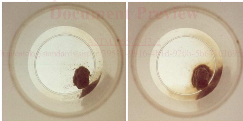
(a) Grade 1