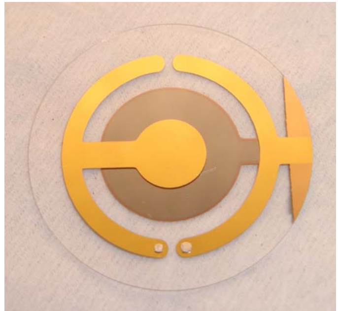
FIG. 2 Quartz Crystal (Front) Showing Proper Location of Indium Wire

combustible liquids. Appropriate shielding should be used for any containers under pressure. Pressurize and depressurize the reactor vessel slowly using the appropriate personnel shielding. Never attempt to open the reactor vessel while it is pressurized. Where appropriate, fuel and solvent handling should be conducted in a fume hood.