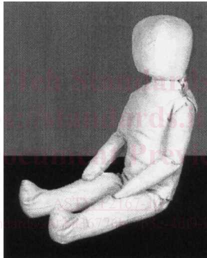
FIG. 2 CAMI Newborn Dummy (7.5 lb, 3.4 kg)

16 CFR 1500.48 Technical Requirements for Determining a Sharp Point in Toys or Other Articles Intended for Use by Children Under Eight Years of Age