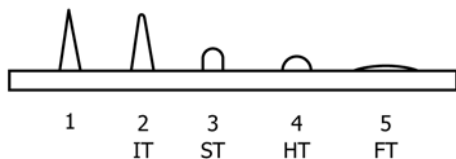
FIG. 1 Critical Temperature Points