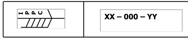
FIG. 2 US Treatment Mark Alternate Example (Typically Used with Pallets)