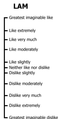
FIG. 1 Labeled Affective Magnitude Scale

The verbal anchors are spaced on the LMS based on calibration using ratio-scaling. It is critical that the spacing be maintained in order to accurately