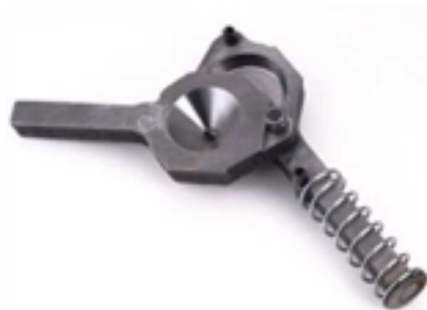
FIG. 2 Scissor Mold