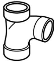
90° Tee S × S × S 2"