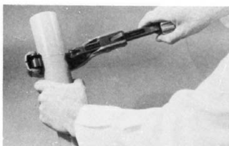
FIG. X3.1 Apparatus for Cutting Tube