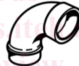
90° Sweep Ell SPG × S 2"