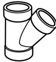
45° Wye S × S × S 2"