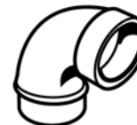
90° Medium Sweep Ell SPG × S 2"