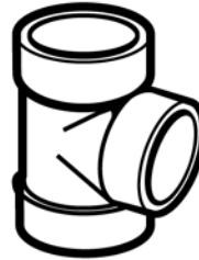
Short Tee S × S × S 2"