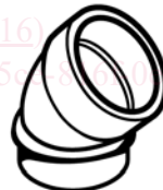
45° Ell SPG × S 2"