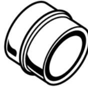
Spigot Adapter S × S 2"