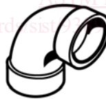
90° Medium Sweep Ell S × S 2"