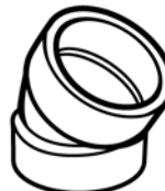
30° Ell S × S 2"