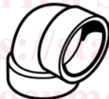
90° Short Ell S × S 2"