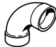
90° Sweep Ell S × S 2"