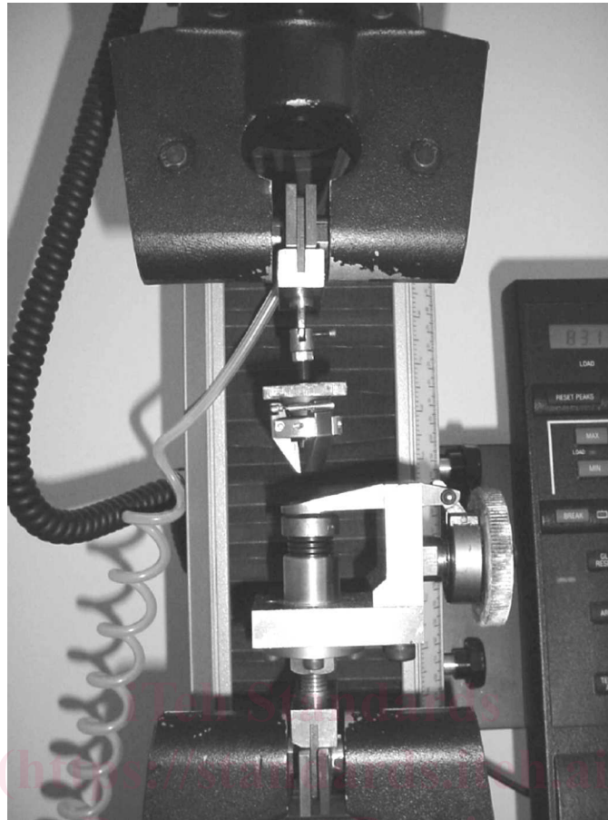
FIG. 3 Closeup of CRE-Type Tensile Testing Machine Fixture Setup.