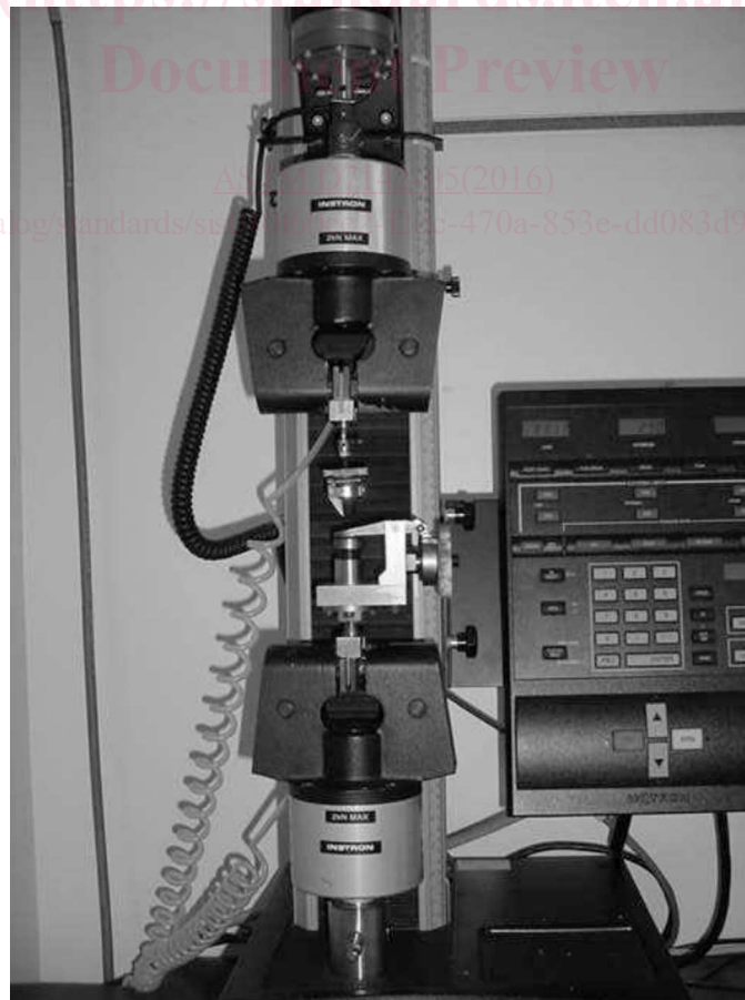
FIG. 2 CRE-Type Tensile Testing Machine setup With Test Fixtures For Option 1.