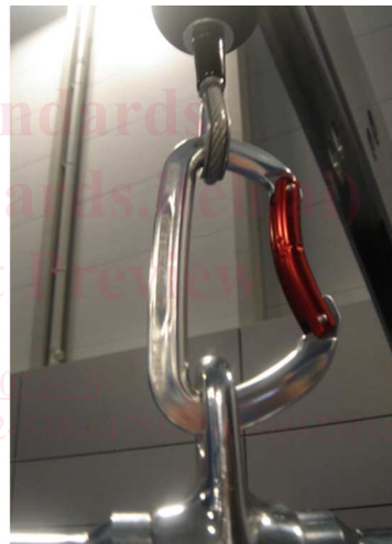
FIG. 4 Example of D-Shaped Carabiner

NOTE 39—Braille may be added in addition to other raised iconography.