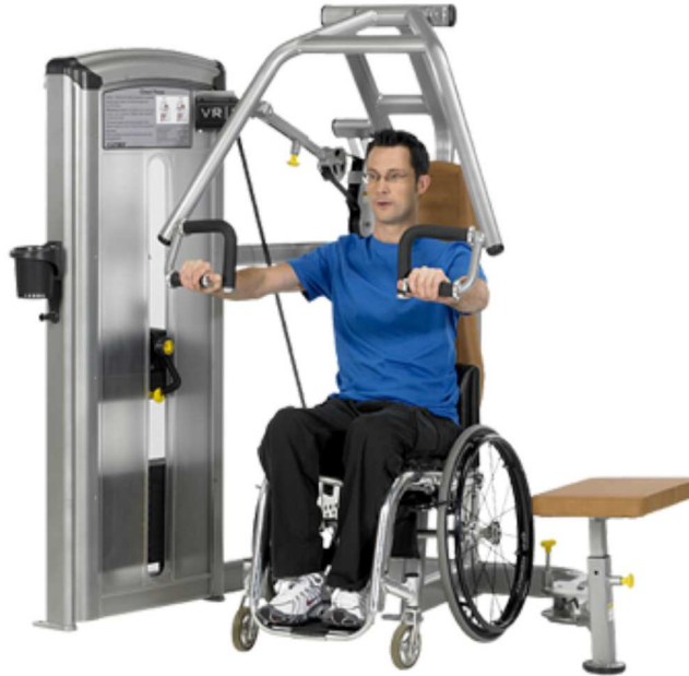
FIG. 2 Example of a Movable Seat

5.1.2.11 All postural supports/surfaces shall be cleanable and padded to a minimum depth of 12.7 mm (0.5 in.) of foam. The manufacturer shall disclose the thickness of the padding, the density of the padding per ISO 845 with a minimum of 75 kg/m 3 , and the hardness per ISO 2439 with a minimum of 315 N (70.81 lbf).