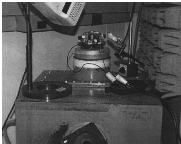
FIG. 1 Motor Mounted to Plenum Chamber

7.5 Connect a manometer or equivalent instrument to the plenum chamber.