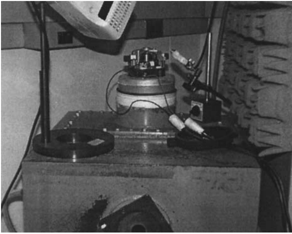
FIG. 1 Motor Mounted to Plenum Chamber