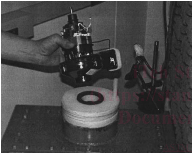
FIG. 2 Example of Standoff Pipe

the barometric pressure to the nearest 0.02 in. (0.51 mm), and the dry-bulb and wet-bulb temperatures to the nearest 0.2°F (0.1°C).