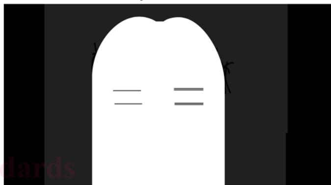
Test Method B: Ratio of Cycles to Failure of Test Paint and Reference Paint