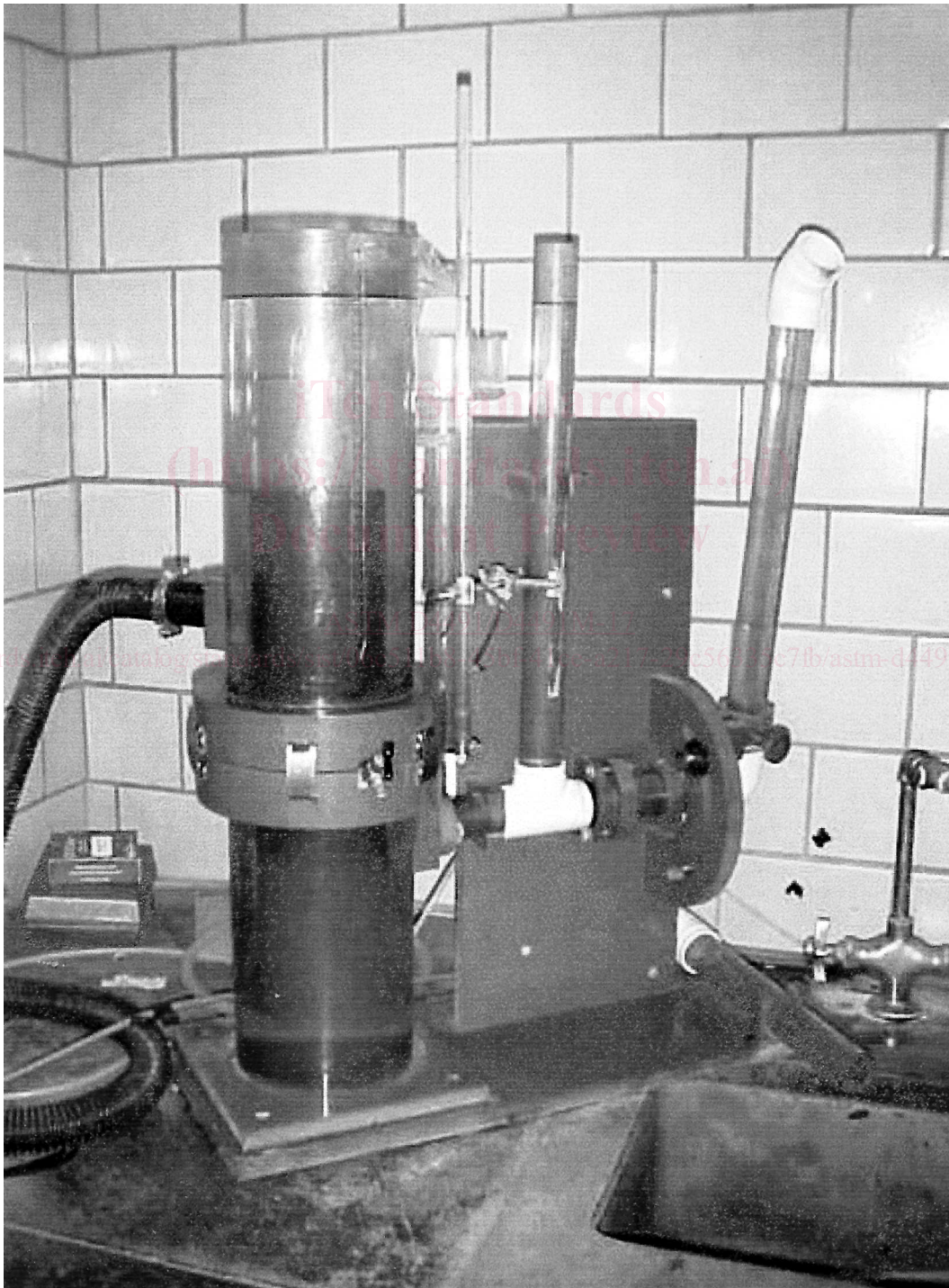
FIG. 1 Constant and Falling Head Permeability Apparatus

6.3 Refer to Fig. 1 for a schematic drawing of a device that conforms to all of the above requirements. The device consists of an upper and lower unit, which fasten together. The geotextile specimen is positioned in the bottom of the upper unit. There is a standpipe for measuring the constant head value. The rotating discharge pipe allows adjustment of the head of water at the bottom