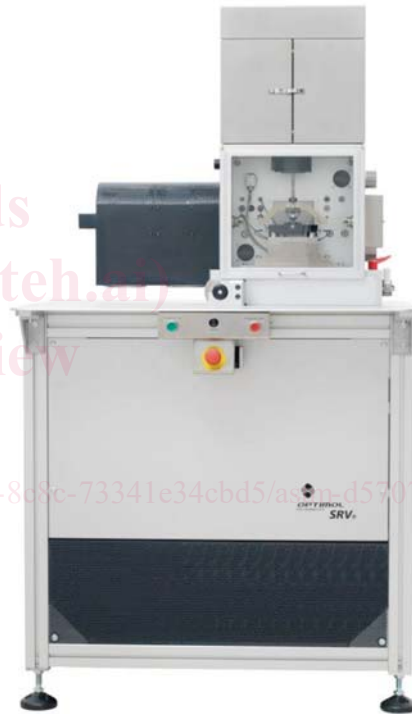
FIG. 3 SRV Test Machine (Model IV)