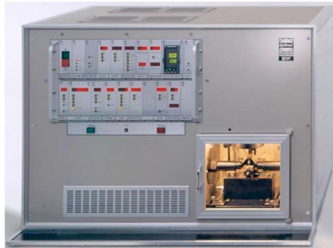
FIG. 1 SRV Test Machine (Model III)