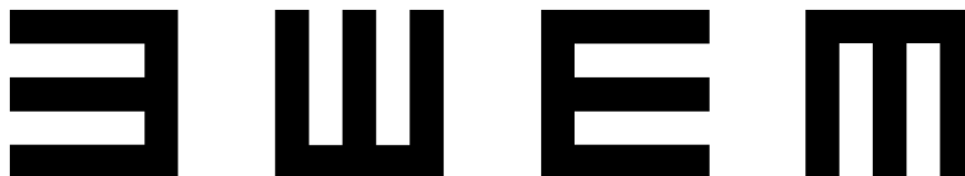
FIG. 1 Tumbling E Optotype in Various Orientations

3.1 The commonly used distance for measuring visual acuity is 20 ft in the United States. This leads to the “Snellen fraction” as the common measure of visual acuity: 20/20, 20/40, and so on. The Snellen fraction is also used in England, referred to 6 m