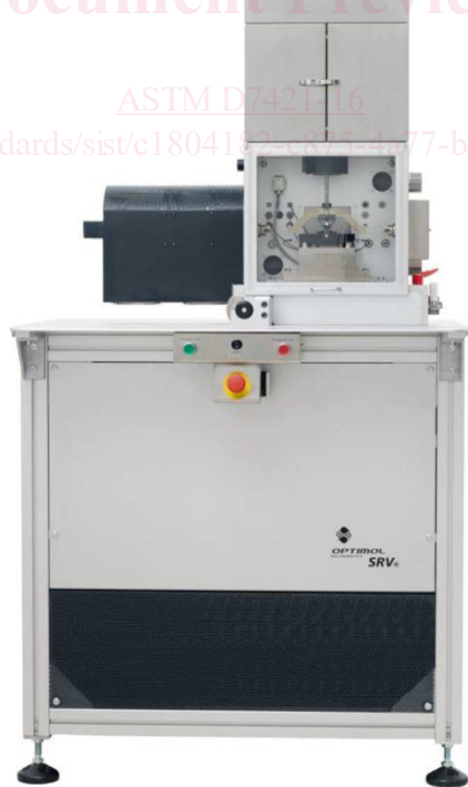
FIG. 23 SRV Test Machine (Model IV)

8.7 Turn on the heater control, and preheat the disk holder to the desired temperature. 50°C, 80°C, and 120°C are recommended (see Table 1). When the temperature has stabilized, turn on the chart recorder and depress the drive start toggle switch until the timer begins to count and then adjust the stroke amplitude knob to 2.00 mm.