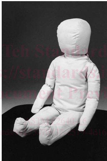
FIG. 2 CAMI Infant Dummy Mark II

6.4.2 The child restraint system shall include both waist and crotch restraint designed such that the use of the crotch restraint is mandatory when the restraint system is in use.