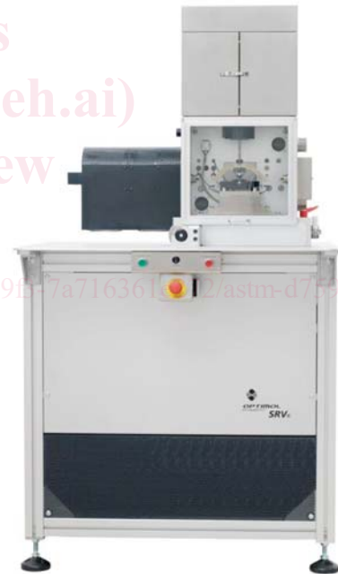
FIG. 3 SRV Test Machine (Model IV)