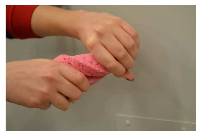
FIG. A2.1 Removing Water from Sponge through Wringing by Hand

A2.5 If the criterion in Step 4 (A2.4) is not met, a new source of sponge material must be obtained for testing.