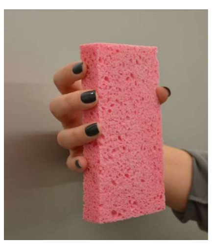
FIG. A2.2 Holding Sponge Vertically