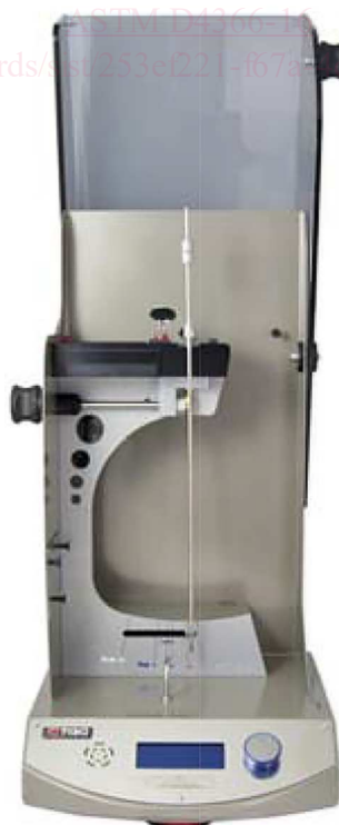
FIG. 1 Apparatus Fully Automated Type