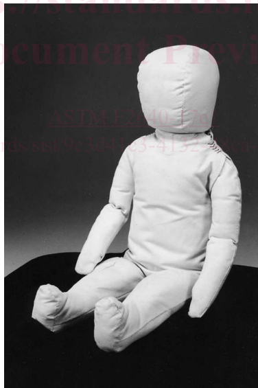
FIG. 2 CAMI Infant Dummy Mark II

6.4.2 The child restraint system shall include both waist and crotch restraint designed such that the use of the crotch restraint is mandatory when the restraint system is in use.