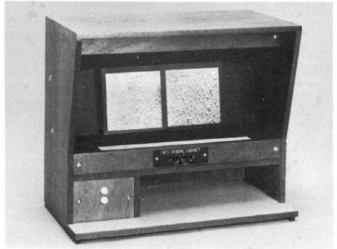
FIG. 2 Apparatus for Fabric Evaluation

5.2 If there is a disagreement arising from differences in values reported by the purchaser and the supplier when using this test method, the statistical bias, if any, between the laboratory of the purchaser and the laboratory of the supplier should be determined with comparison being based on testing specimens randomly drawn from one sample of material of the type being evaluated. Competent statistical assistance is recommended for the investigation of bias. A minimum of two parties should take a group of test specimens, which are as homogeneous as possible and which are from a lot of material of the type in question. The test specimens then should be assigned randomly in equal numbers to each laboratory for testing. The average test results from the two laboratories should be compared using an acceptable statistical protocol and probability level chosen by the two parties before the testing is started. Appropriate statistical disciplines for comparing data must be used when the purchaser and supplier cannot agree. If a bias is found, either its cause must be found and corrected, or