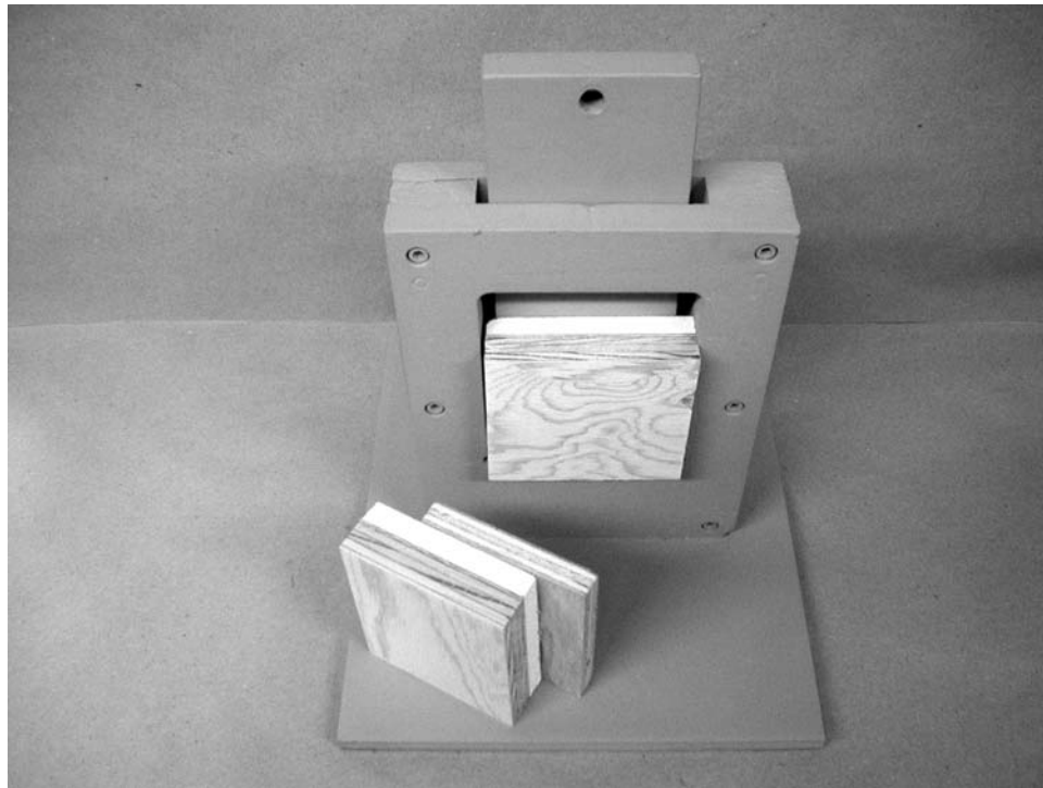
FIG. 1 Shear Strength Test Specimen in Text Fixture