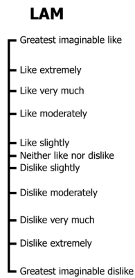
FIG. 1 Labeled Affective Magnitude Scale

The remaining verbal anchors are equivalent to the anchors used with the well-known, nine-point hedonic scale, from “like extremely” to “dislike extremely.” Positions of the verbal anchors were determined by magnitude estimation to be (in terms of % of the scale): 3