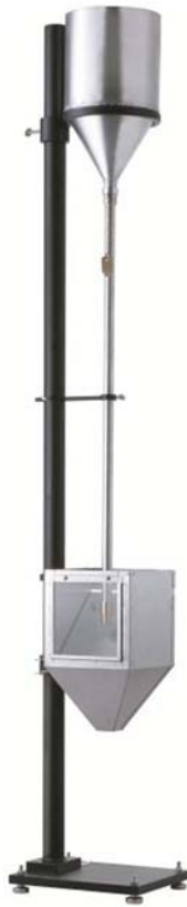
FIG. 1 Apparatus for Falling Sand Abrasion Test