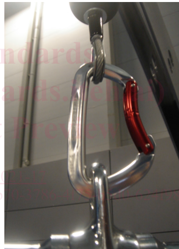
FIG. 4 Example of D-Shaped Carabiner

5.1.3.4 Adjustment mechanisms required for set up shall be easy to reach, use, insert, or remove, or combinations thereof, not requiring fine finger control, excessive wrist rotation, tight grasp, or a pinch grip.