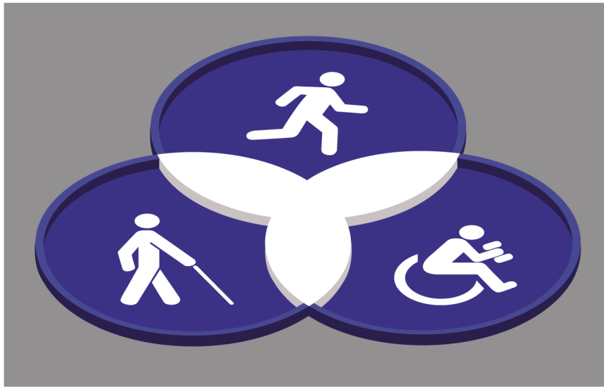
FIG. 5 Inclusive Fitness Symbol

located in a clear line of sight in front of the user with no physical obstruction to interfere with access.