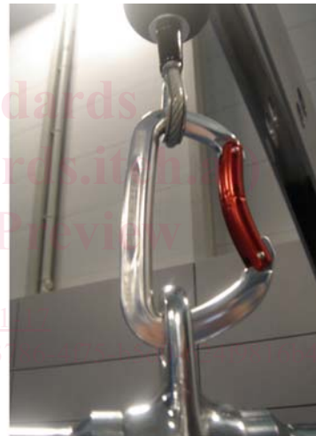
FIG. 4 Example of D-Shaped Carabiner

5.1.3.4 Adjustment mechanisms required for set up shall be easy to reach, use, insert, or remove, or combinations thereof, not requiring fine finger control, excessive wrist rotation, tight grasp, or a pinch grip.