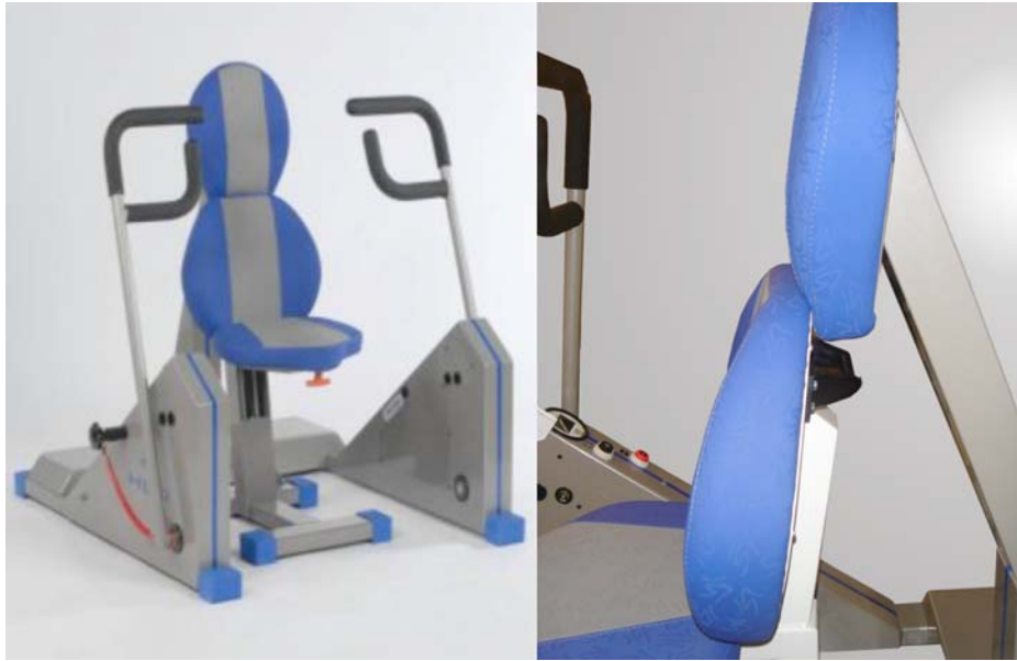
FIG. 3 Example of a Physical Locating Mechanism