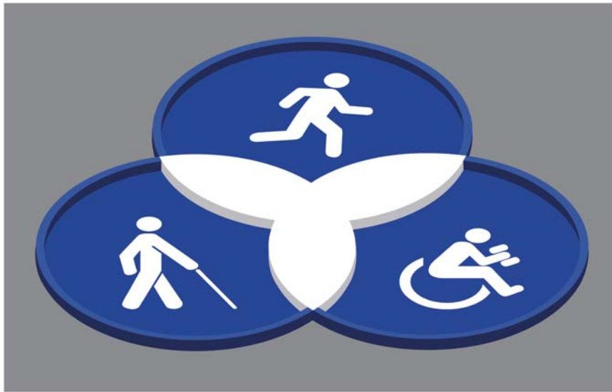
FIG. 5 Inclusive Fitness Symbol

located in a clear line of sight in front of the user with no physical obstruction to interfere with access.