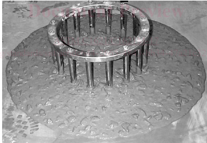
FIG. 3 J-Ring Flow

6.4 Strike-off Bar —As described in Test Method C173/C173M.