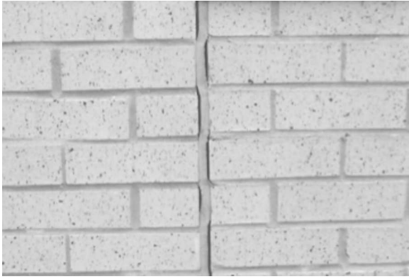
adhesion failure, n—in building construction , failure of the bond between a sealant and a substrate.

Discussion—This definition pertains to interfacial adhesion failure, a lack of bond at the interface between the materials. Interphasal adhesion failure, within the sealant or substrate near the interface, is less common and may appear to be interfacial without the use of magnification.