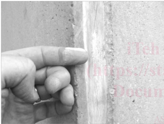
chalking, v—in building construction , formation of a powder on the surface of a sealant that is caused by the disintegration of the polymer or binding medium due to weathering.