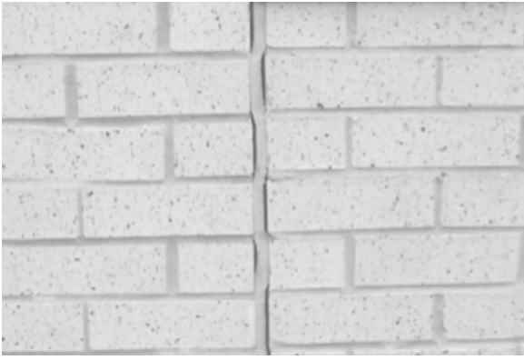
adhesion failure, n—in building construction , failure of the bond between a sealant and a substrate.

Discussion—This definition pertains to interfacial adhesion failure, a lack of bond at the interface between the materials. Interphasal adhesion failure, within the sealant or substrate near the interface, is less common and may appear to be interfacial without the use of magnification.