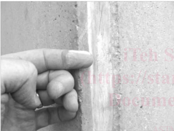
chalking, v—in building construction , formation of a powder on the surface of a sealant that is caused by the disintegration of the polymer or binding medium due to weathering.