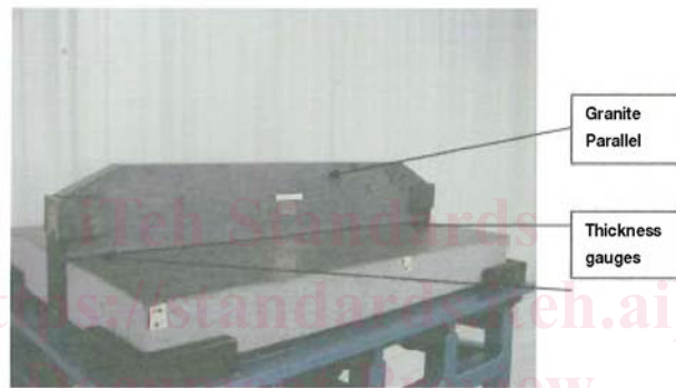
FIG. 4 Example of a Table and Granite Parallel Used to Measure Straightness by the Roll Test