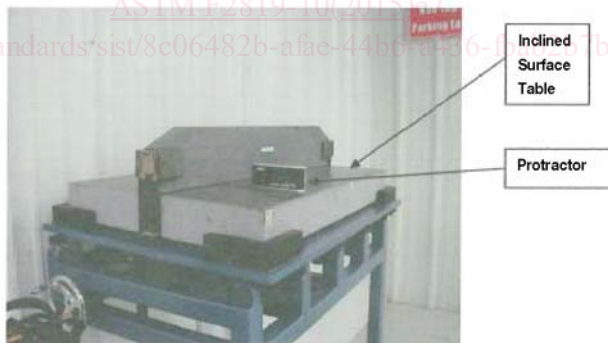
FIG. 5 Example of Inclined Surface Table and Protractor Used to Measure Straightness by the Roll Test Method

or subjected to a forming practice such as bending needs to be very linear or straight so it is accurately fed into the equipment that is used for the machining or forming practice. Laser machining is an example of a machining operation that requires a wobble-free piece of rod, tubing, or wire so that it can be properly fed into the alignment bushings of the laser. Wire forming equipment also requires wobble-free material for the same reason.