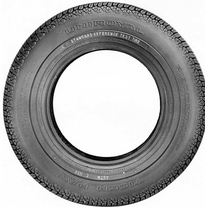
FIG. 2 Side View of the P195/75R14 Radial Standard Reference Test Tire

4.4 Beginning in 2014, the tire is marked with an arrow which provides a rotational orientation for those testers who choose to reference it. (See Fig. 3.)