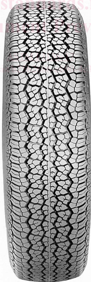
FIG. 1 Front View of the P195/75R14 Radial Standard Reference Test Tire