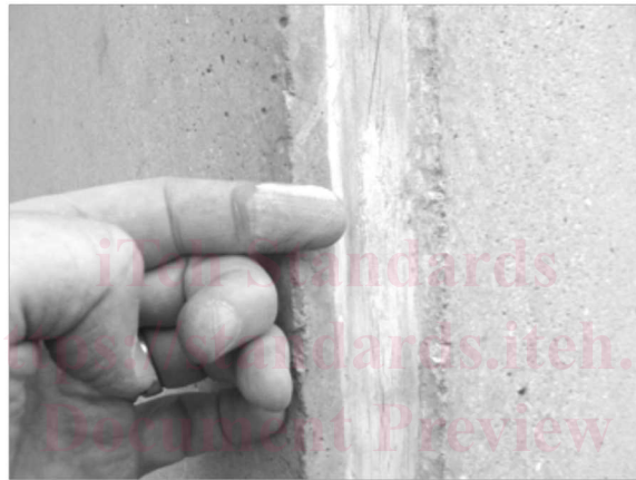
FIG. 1 Adhesion Failure

chalking, v—in building construction , formation of a powder on the surface of a sealant that is caused by the disintegration of the polymer or binding medium due to weathering.