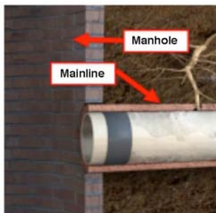
FIG. 1 SMHG End Seal Sleeve

4.1.2 The SMHG Connection Seal is attached to the Main/Lateral Connection Liner after resin impregnation by two stainless steel snaps located on opposite sides of the SMHG Connection Seal. The SMHG Connection Seal can be manufactured to fit a Tee or Wye connection. Once the liner is installed and cured the SMHG Connection Seal shall remain