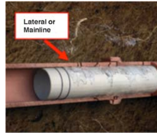
FIG. 3 SMHG O-Ring

3.2.13 sectional liner —CIPP installed in a portion of the main or lateral pipe for repairing a localized defect or a section of the pipe.