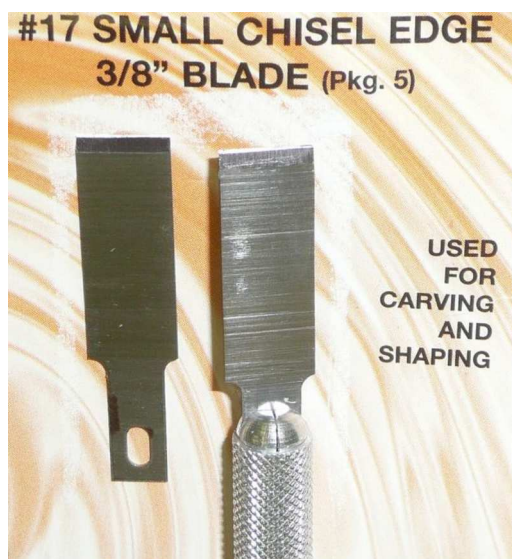
FIG. 1 #17 Blade

8.1 Multicomponent Sealants —Prepare six test specimens for each type of substrate that is to be used in the test. After maintaining the unopened sample for at least 24 h at standard conditions, mix thoroughly for 5 min at least 250 g of base compound with the appropriate amount of curing agent. Extrude the sealant 12.7 by 12.7 by 50.8 mm ( \approx 0.5\frac{1}{2} by \frac{1}{4}0.5 by 2 in.) between