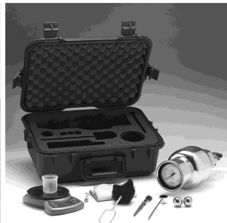
FIG. 1 Typical Calcium Carbide Gas Pressure Test Apparatus for Water Content of Soil

FIG. 1a (left) Apparatus Set with Manual Tared Balance