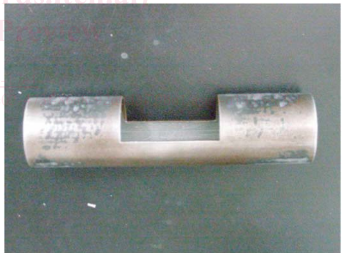
FIG. 2 Cylinder Configuration

covering as directed in an applicable material specification or other agreement between the purchaser and the supplier. Consider the rolls, or pieces, of pile yarn floor covering to be the primary sampling units. In the absence of such agreement, take one roll or piece from the lot to be tested.