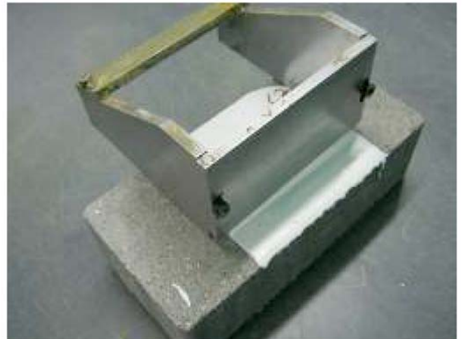
FIG. 5 Warmed Drawdown Bar

samples can be used to simulate fresh asphalt and the cut side worn or aged asphalt surfaces (Fig. 4).