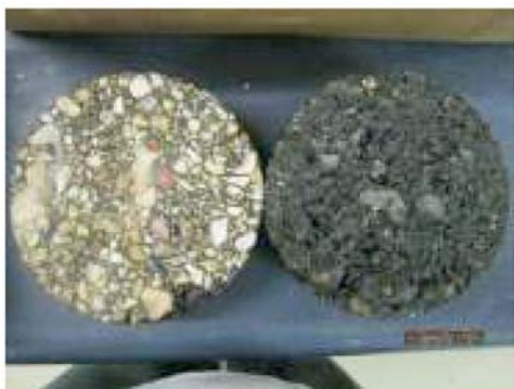
FIG. 4 Asphalt Samples

11.1 In order to minimize the energy absorption, compression and deflection of the support, affix the tester to a dense, solid block. Place this block or base at a height suitable for ease of operation. It is not necessary to bolt blocks or bases over