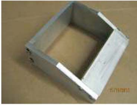
FIG. 3 Drawdown Bar