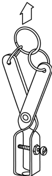
FIG. 3 Tension Test Adapter/Clamp

7.2 Tray, Drop Test —From a height of 36 in. (900 mm) measured from the center point of the tray, drop the tray on vinyl tile over concrete flooring once on each of four different surfaces, one surface of which shall include the attaching mechanism. Do not conduct this test on trays that require a tool to remove tray from booster seat.